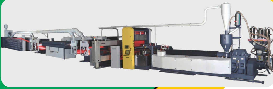
TAPE STRETCHING LINES