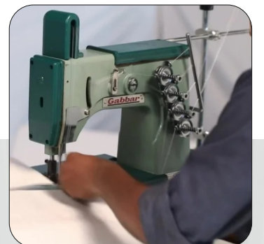
BAG SEWING MACHINE